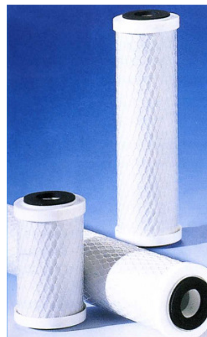
Type 01 - 04

Potable water, spirits, water based and organic solvents for removal of color, smell taste contamination. Galvanic baths, removal of organic contamination from nickel and copper baths, through anodic oxidation or cathodic reduction